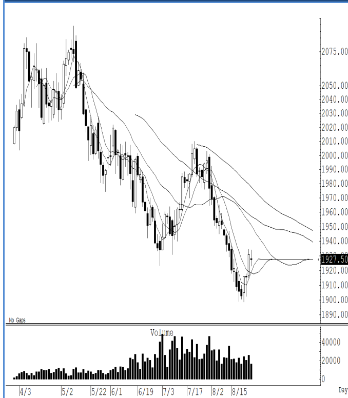
GOU23 (Close 1,927.50 Chg -3.40)

ราคาทองคำโลกเริ่มแกว่งฟื้นตัว และปรับตัวขึ้นดีกว่าเราคาด เราแนะนำขายการด์สูงหรือตั้ง stop ไว้ หรือแนะนำ trading ในกรอบ 1,915-1,950 ดอลลาร์ รับรู้กำไร แต่ถ้าในกรณีที่ปิดต่ำกว่าระดับ 1,915 ดอลลาร์ แนะนำ ถือ short หวังผลปรับตัวลงไปแถว ๆ 1,880 ดอลลาร์ รับรู้กำไร